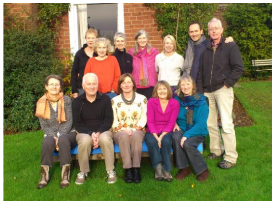
The CMRP Teaching team December 2011