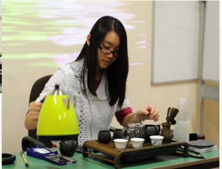
A Chinese volunteer

According to scientific studies, tea contains more than 600 chemical ingredients. Some of them are nutrients necessary for human body, e.g. vitamins, proteins, amino acids and so on.