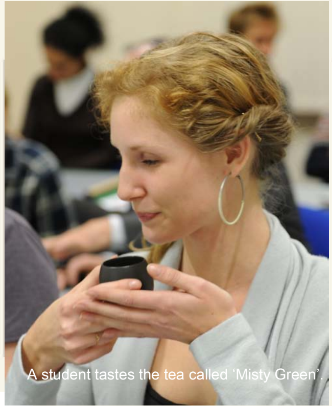
A student tastes the tea called 'Misty Green'.