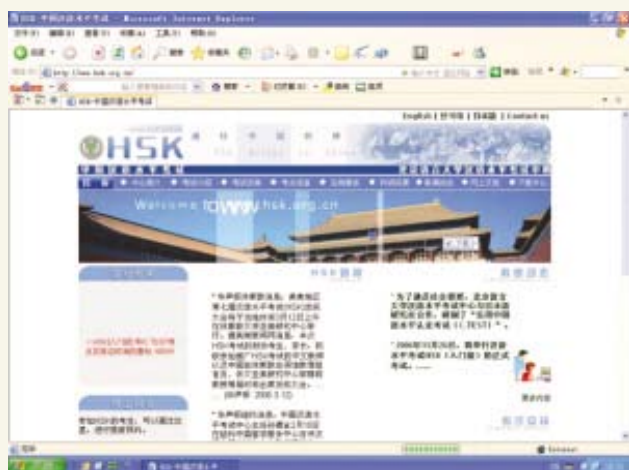
Hanban HSK Test Website