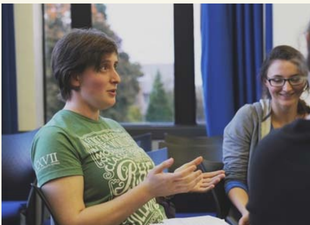
Students practising Chinese in the class.