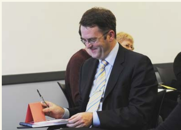
An academic from the law school at the class