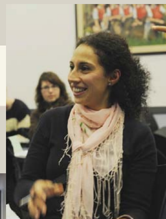
Students learning and having fun!