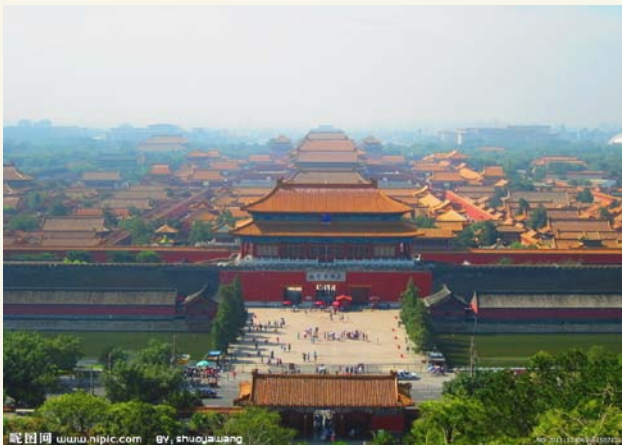
The Forbidden City