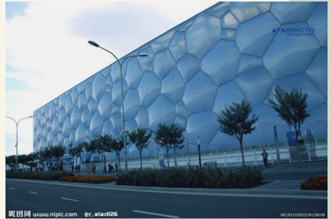
The Water Cube