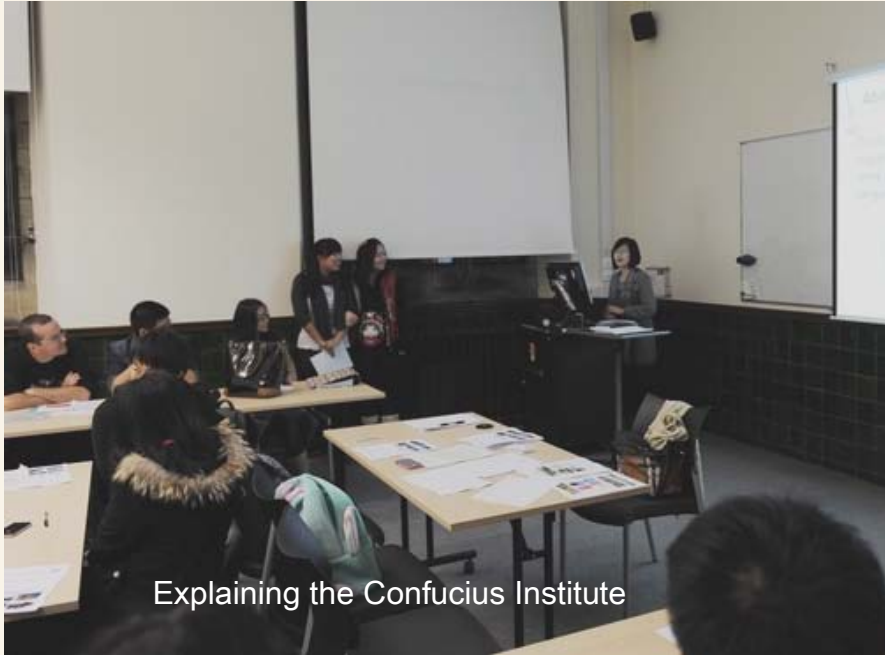
Explaining the Confucius Institute