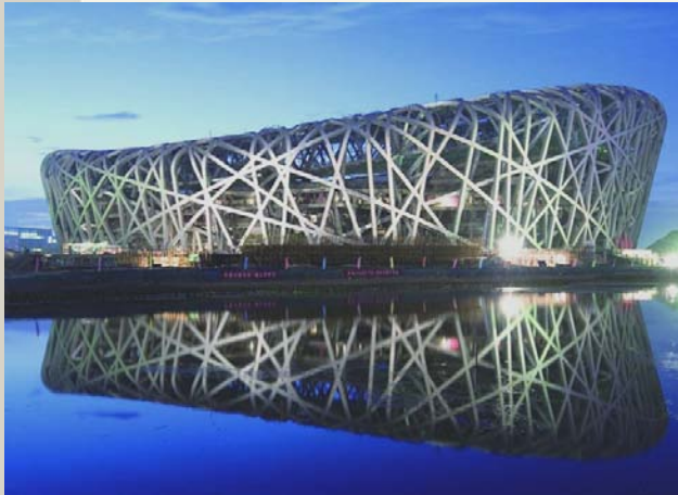
The Bird's Nest

AT BANGOR UNIVERSITY NEWS LETTER 6 - OCTOBER 2012