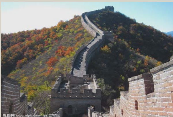
The Great Wall