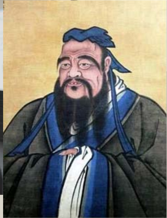
Confucius (551 BC – 479BC)

The Confucius Institute is a non-profit institute, which aims at promoting the spread of Chinese language and culture and encouraging cultural exchanges. It is generally based at educational institutions such as foreign universities and research institutions. The Confucius Institute at Bangor is jointly funded and was set up by Bangor University and China University of Political Science and Law (CUPL)