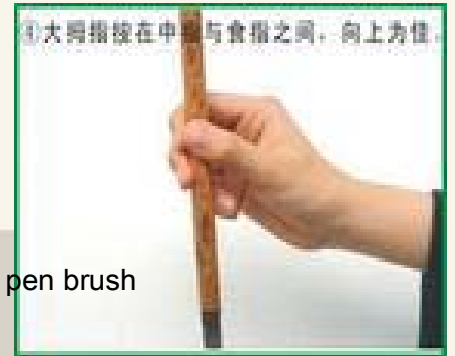
How to hold a pen brush

Lishu, Regular script, Running Script, Cursive