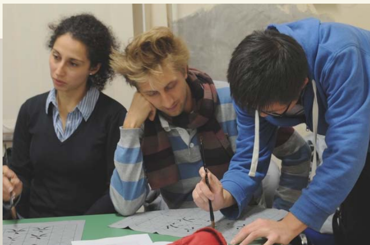
The class was helped by some Chinese volunteers