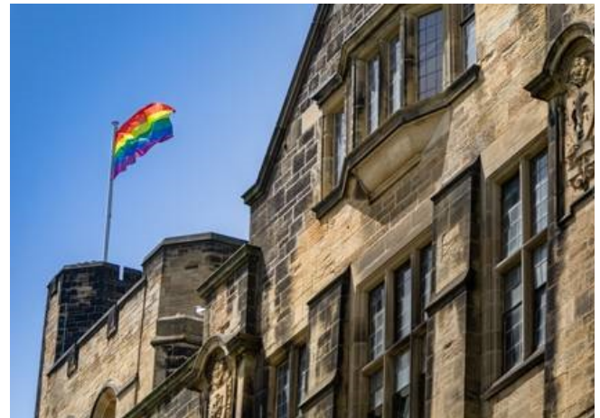
Photograph of rainbow flag flying above the historic Main Arts building.