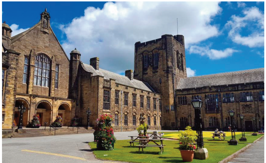
Bangor University's Main Arts Building

This comes as no surprise to the institution which was again recently cited the eighth greenest University worldwide in the UI Green Metric but it also underlines