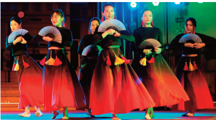
The Confucius Institute performing a dance