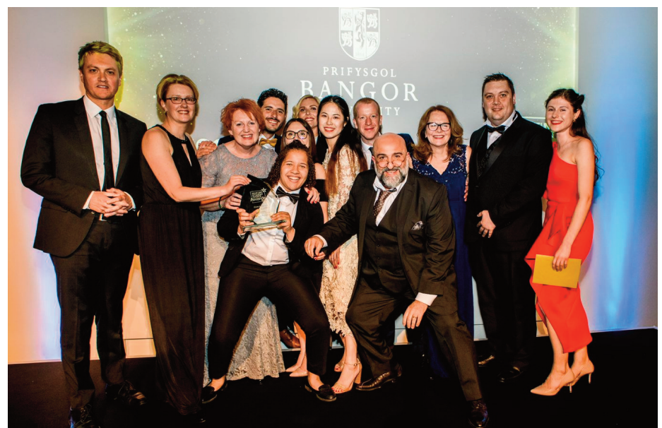
The Bangor team, representing all eight areas nominated for Awards, celebrate their success with the Award night's celebrity host, comedian, Omid Djalili

Bangor University was nominated for Awards in the following eight categories: University of the Year, Accommodation, Clubs & Societies, International, Giving Back, Job Prospects, Student Support and Postgraduate.