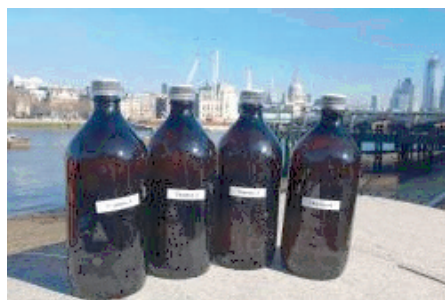
Samples from the river Thames headed for analysis at Bangor University

system, researchers were able to identify and count microplastic pollutants (less than 5 mm in size) per litre of water, such as plastic fragments, fibres and film.