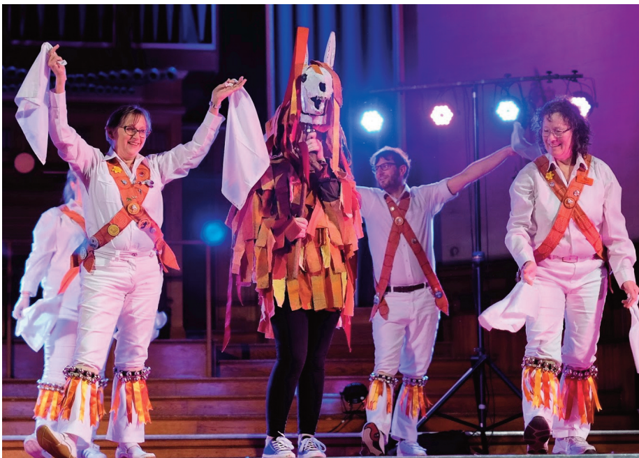
The Folk Society