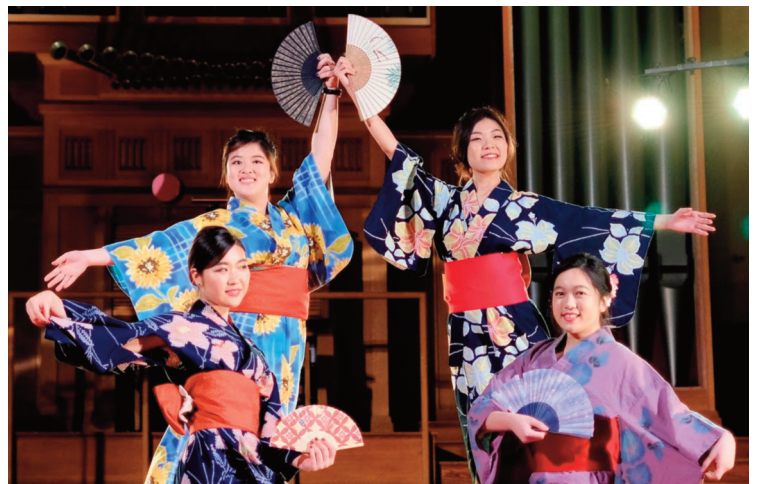
The Japanese Society