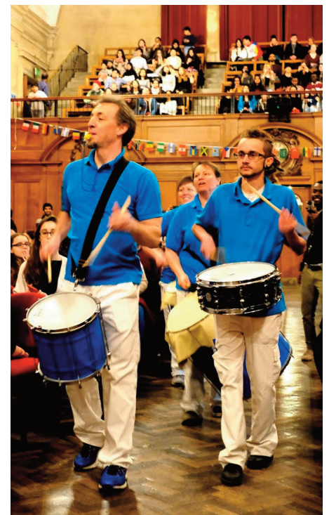
The drummers who started off the evening with their amazing entrance