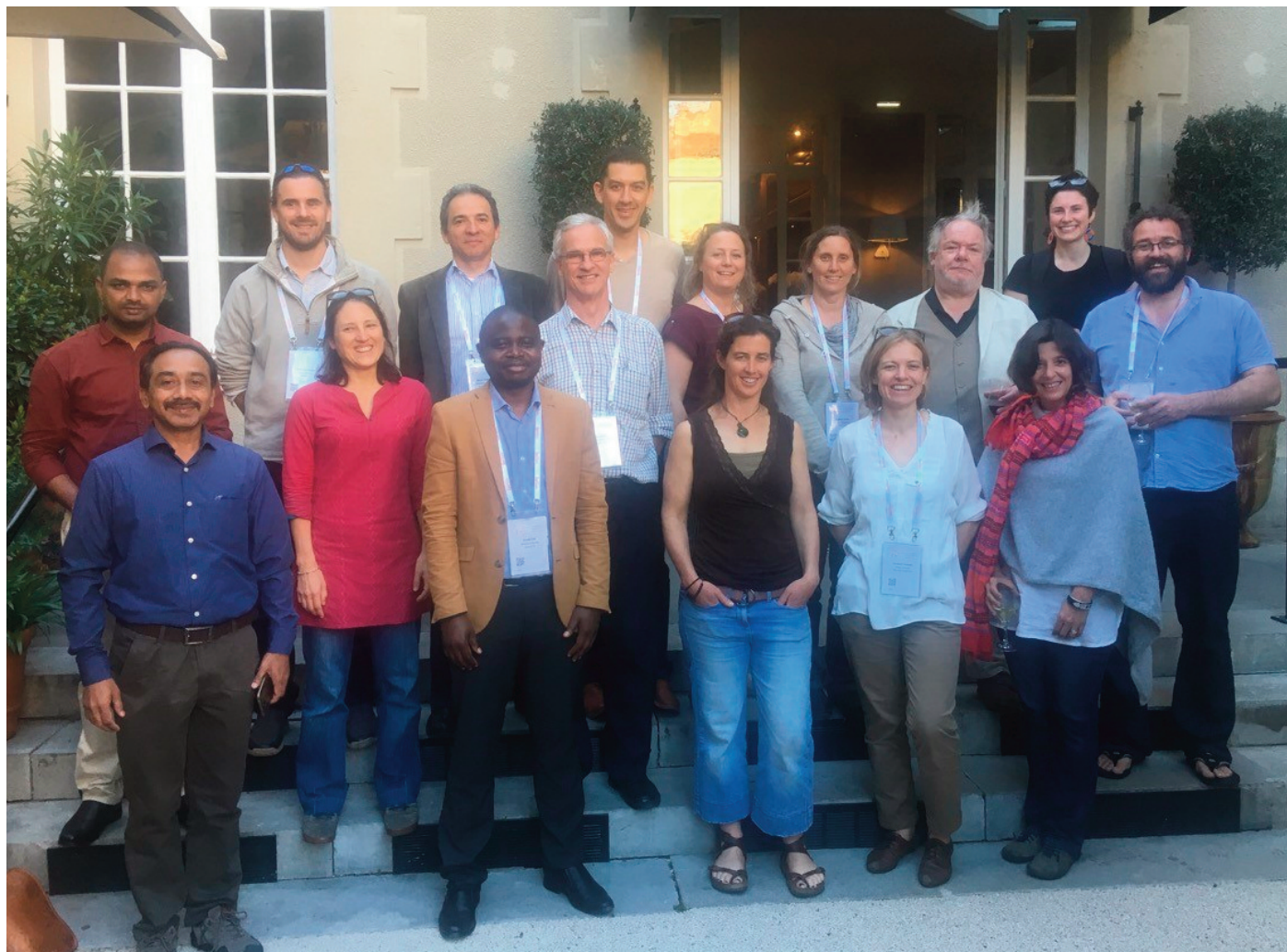
Bangor University staff pictured with some of the Alumni attendees

Recently with support from the International Education Centre, staff from the School of Natural Sciences hosted an event at the 4th World Congress on Agroforestry in Montpellier, France. Bangor University has a large number of international students and makes efforts to keep in touch with alumni wherever they are in the world. At the hotel Oceania in Montpellier, staff, alumni, current and prospective students shared stories, networked and learned about recent developments at Bangor University as well as far beyond.