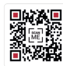
COVID -19 Information