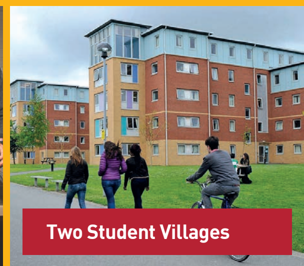
Two Student Villages