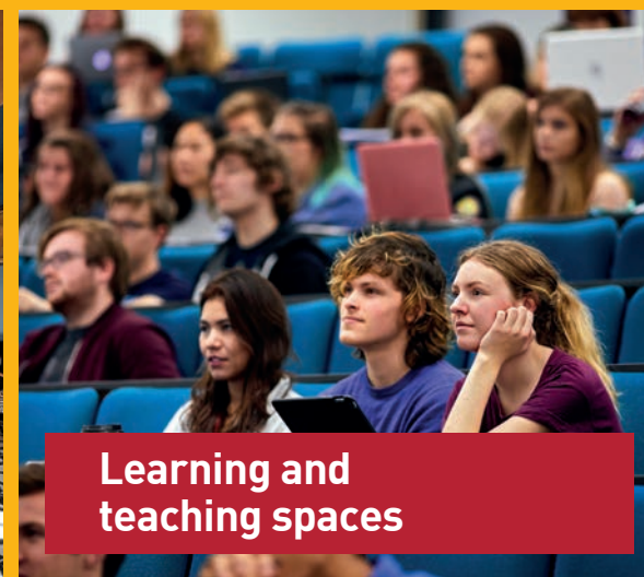
Learning and teaching spaces