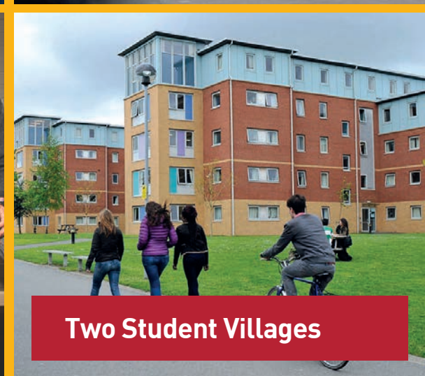
Two Student Villages