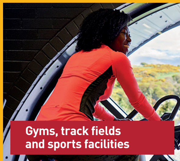
Gyms, track fields and sports facilities