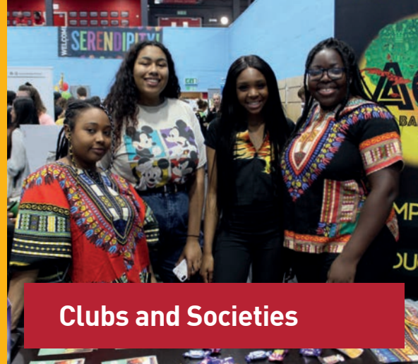
Clubs and Societies