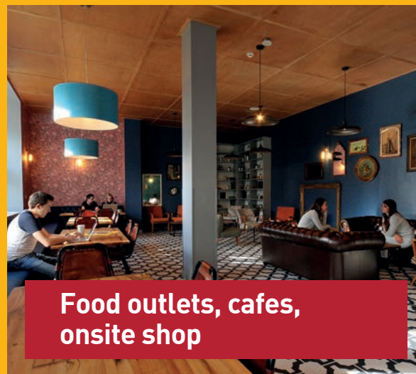
Food outlets, cafes, onsite shop