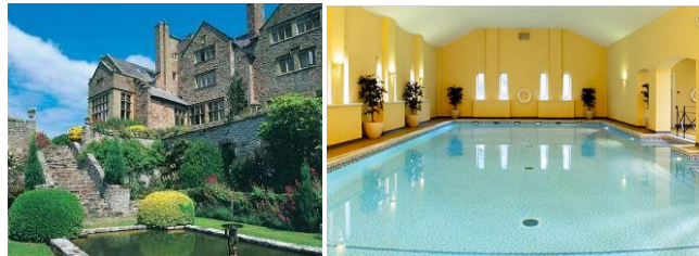
Bodysgallen Hall Llandudno