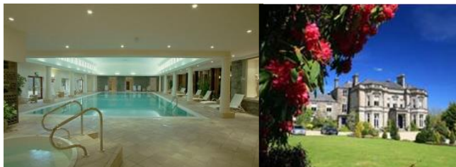
Tre-Ysgawen Hall Capel Coch, Llangefni