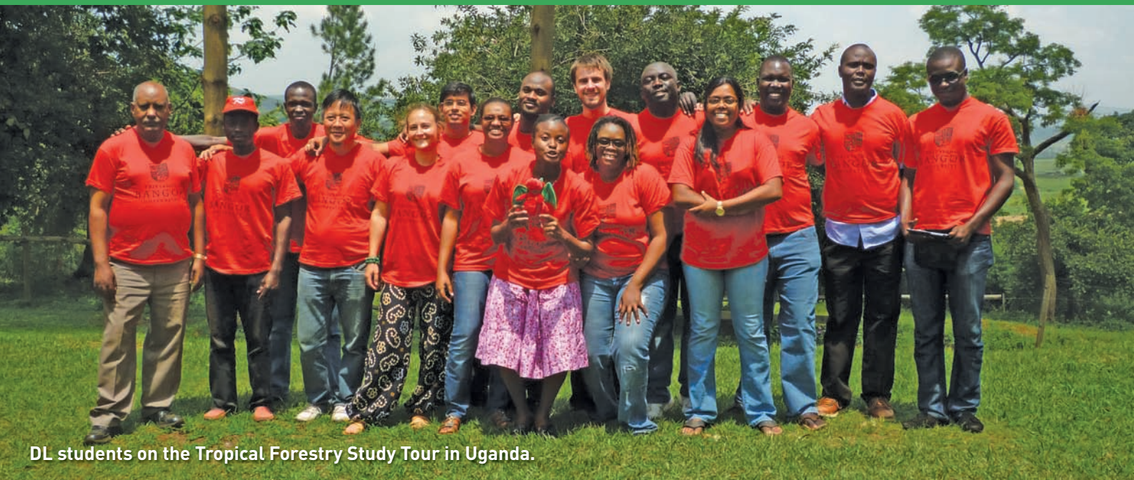
DL students on the Tropical Forestry Study Tour in Uganda.

Attendance at the two-week study tour in July/August is compulsory for all students and is for many one of the highlights of this course. The Management Planning module also includes a residential component and takes place in the second year.