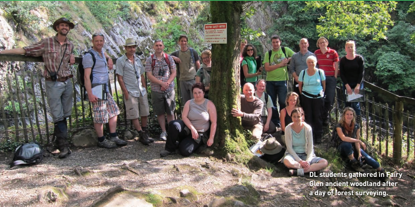
DL students gathered in Fairy Glen ancient woodland after a day of forest surveying.